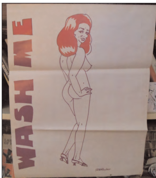
Spain in Comic Art Show at Peace Eye November 7, 1968

Spain designed a series of posters for Peace Eye which I had printed in late '68. Here's one of them, titled "Wash Me":