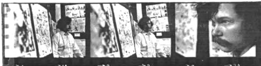
The Author Standing in Peace Eye with the Comic Art on the Wall

Peace Eye was packed that night—even Robert Frank showed up!— and so were the fine-drawn walls: