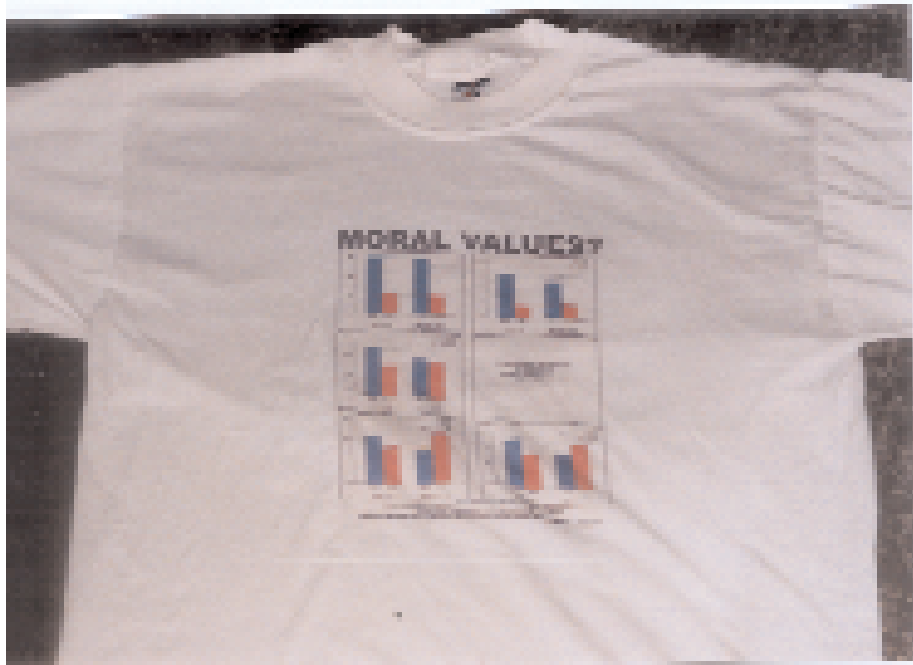
The Stolen Election Teeshirt

Million upon millions of Americans are convinced that a number of important recent computer-counted elections in the United States have been stolen, though you'd never get that sense reading and watching the mass media, much of which has been taken over by right wing firebreathers and even right wing sleaze. (There's a difference between firebreathers and sleaze, though both sorts don't seem to mind if elections are stolen, as long as they are stolen by the right.)