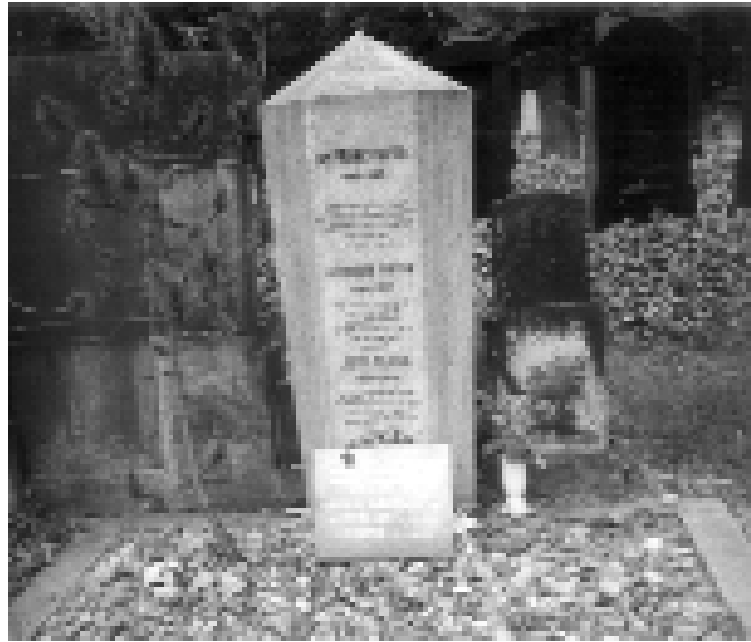
Kafka's final home

I noticed that beneath many of the stones that visitors bring to Jewish gravesites visitors placed notes, so I jotted a poem to Franz, and put it behind his tall monument.