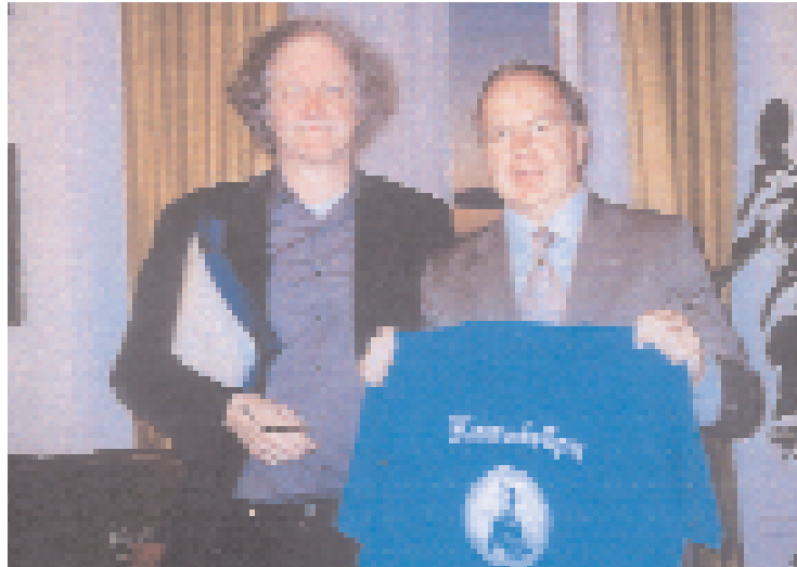
The author with Greek Ambassador Skossípentarchos holding the Cassandra tee