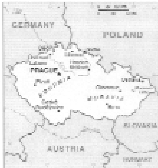
The Czech Republic in 2005

Things were hopping, as they say, and it appeared, correctly, as if the Czechoslovakian government might be at last overthrown. Then came the far-famed Velvet Revolution, and the election of Vaclav Havel as President, and then the peaceful separation of Czechoslovakia into the Czech Republic and the Slovak Republic.